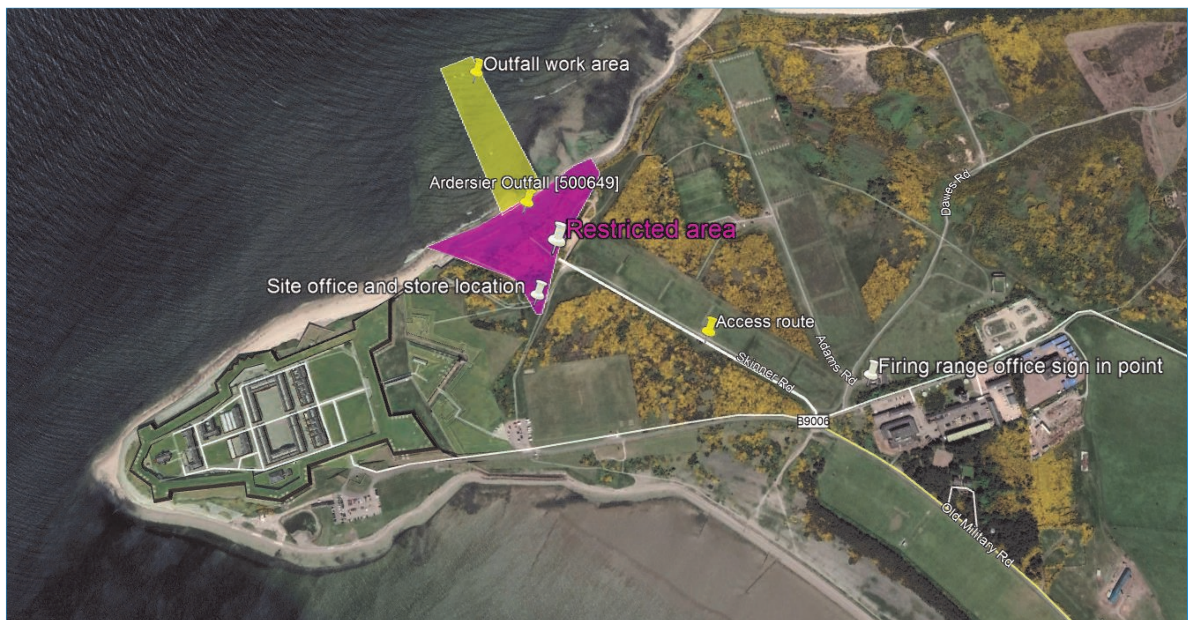
Outfall extension site layout and area of restricted access (February to May).

The map below shows the location where work will be taking place to extend the outfall pipe by around 300 metres.