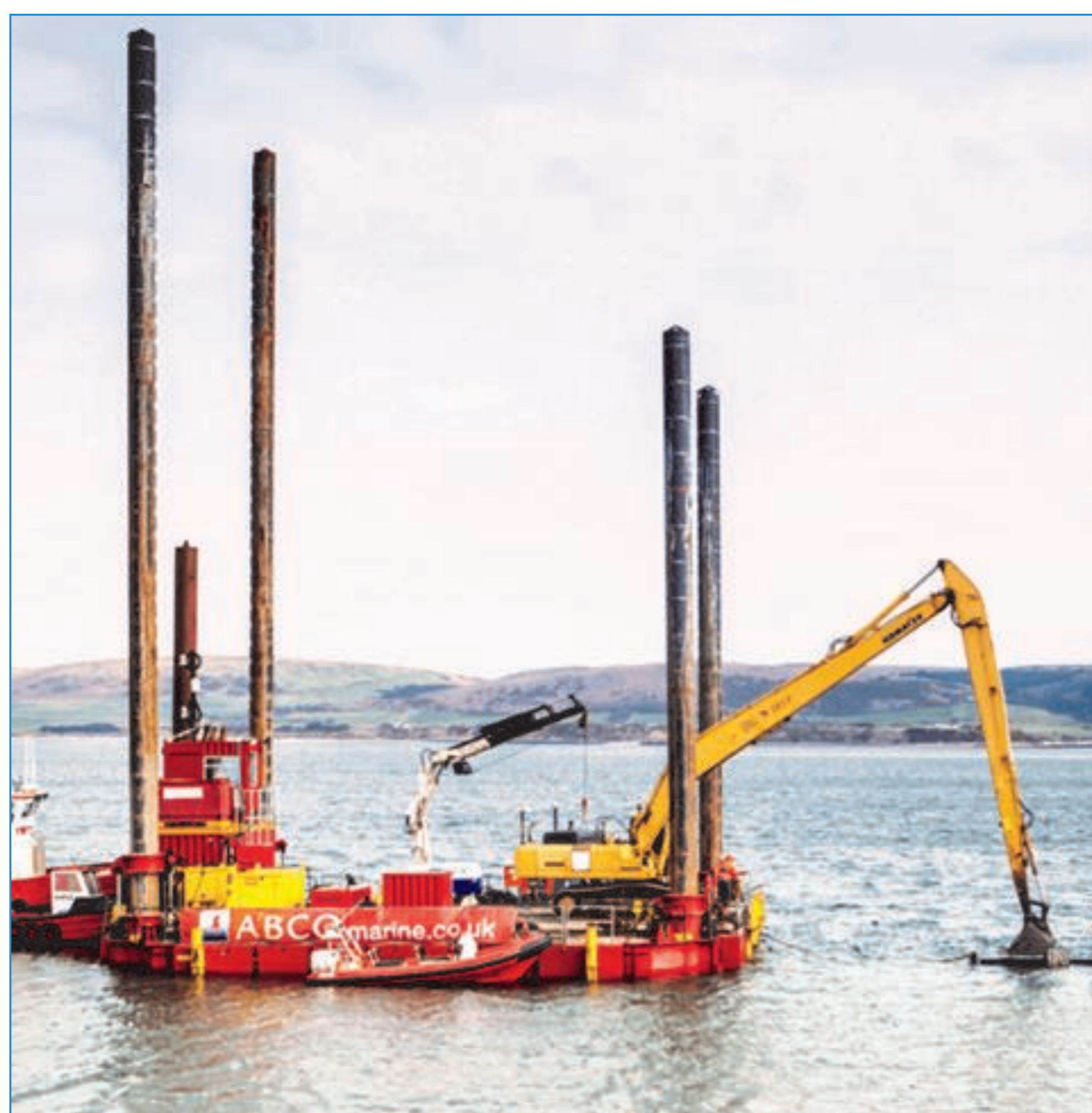
Jack-up barge and long-armed excavator (ABC Marine)

A diffuser will also be fitted at the end of the pipe. This includes a non-return valve which is designed to close at high tide. Some rock armour will be installed to protect the diffuser from the effects of storms. At a distance of approximately 300 metres from the shore, the effluent will be rapidly dispersed.